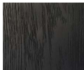
// true black (stain)