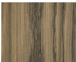
// whiskey (stain)